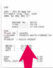
Gatepost ticket print